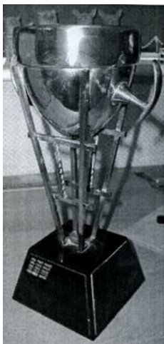
The East Anglia Trophy

In the middle 1950's, I was studying "Building" in London and was invited to weekend in Bath by a friend and colleague. He had recently bought a 1920's 3 litre Bentley with Vanden Plas body, which had cost him less than £300. Those were the days!! The car was rough and the engine well down on power, but I thought that it was wonderful and we duly set out on the A4 (no motorways!). Somewhere near Hungerford we were passed by a Morris 10, with four up and we commented that the car had only